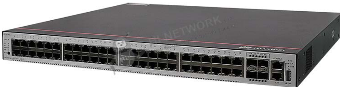
Figure 1 shows the appearance of S5735S-L48P4S-A.